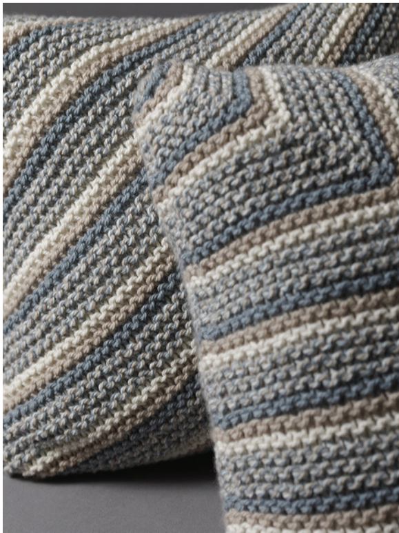
Mitered Throw & Pillows - Classic Elite Forbidden, colors 60550, 10015, 10062, 10137