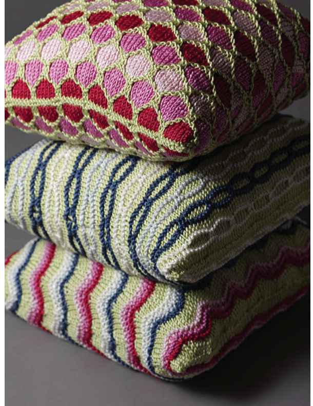
Trio of Pillows - Classic Elite Temptation, colors 1, 14, 17, 21, 27 and 30