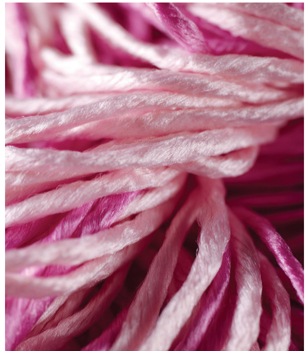
Silk Chapter Cover Page - Classic Elite Temptation, colors 26 and 27