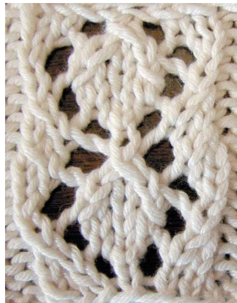
Lace 2 Pattern Swatch

Using Kitchener Stitch join the Left Body and Right Body. Picot Trim: With RS facing, beg at join, pick up and knit 134 (142, 150, 158) sts around center opening. (WS) Knit. (RS) BO 2 sts, *Slip the st on the RH needle back to the LH needle. Using Cable Cast-On method, CO 2 sts, BO 4 sts, rep from * to end. Cut ribbon into two 1½ yard pcs. Thread 1 length through ribbing on each sleeve. Tie in a bow and trim ends to desired length.